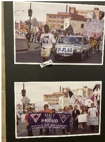
Photo Exhibit / PFLAG at 1 st parade